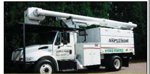
International-Eaton HEV tree trimmer and Bosch Rexroth parallel HRB HHV are two of more than 35 hybrids at HTUF 2008