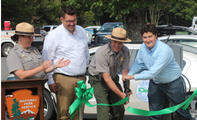
Ribbon-cutting for the National Park Service electric vehicle program.

Stakeholder Funds helps us pursue strategic opportunities that further bolster our work and develop new programs that support our mission, our community and our planet.