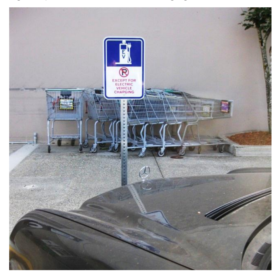
FIGURE 10: UNAUTHORIZED USE OF EV CHARGING STATION

Much still needs to be learned about actual needs and behavior of EV drivers. Public charging stations, still few in number, are in the process of initial rollout. Early results from the EV Project show that only 4 percent of charging events associated with that project occur at public locations.<sup>16</sup>