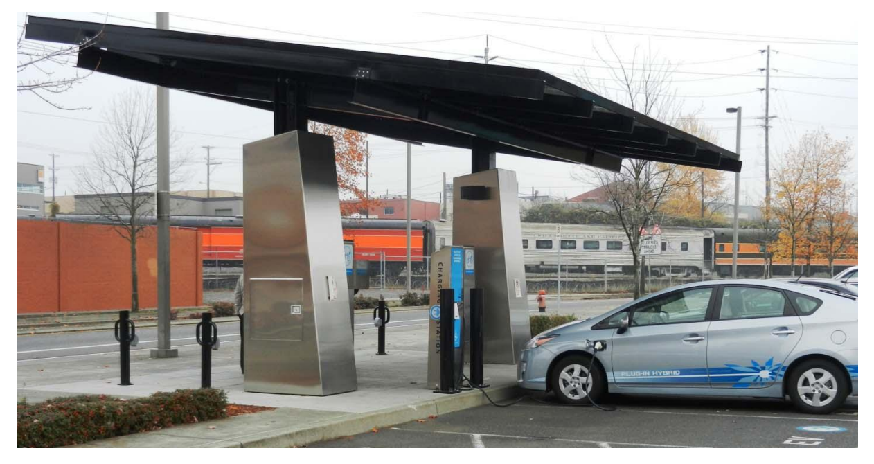
FIGURE 17: EV CHARGING STATION WITH SOLAR CANOPY

Some organizations choose to combine solar generation with the installation of EV charging stations. The needed access to sunlight will guide the siting choices for combined charging station/solar panel installations. The solar array shown in Figure 17 provides shelter for the charging station area.