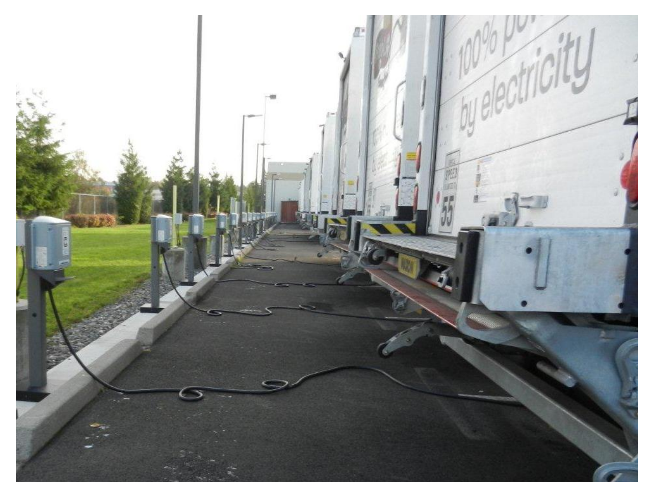
FIGURE 12: TRUCKS USING LEVEL 2 EV SUPPLY EQUIPMENT

Installing a cluster of charging stations as shown in Figure 12 can require substantial electrical upgrades including a new transformer.