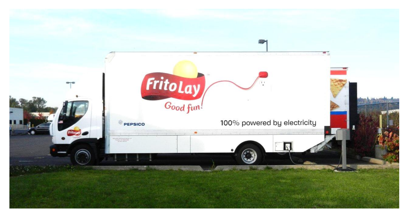
FIGURE 1: ELECTRIC TRUCK AT EV CHARGING STATION

This range of battery-powered electric vehicles serves many applications at industrial sites, business and educational campuses, within neighborhoods, and at citywide or intercity levels.