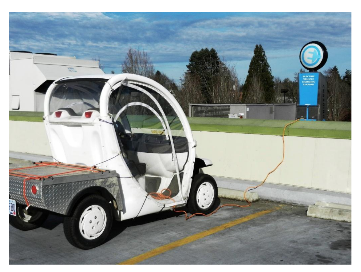
FIGURE 11: NEIGHBORHOOD EV USING A LEVEL 1 CHARGING STATION

Electric cars and plug-in hybrid cars can easily handle these trip lengths. Other types of small, lightweight EVs also have adequate range for citywide trips. These include electric bicycles, urban EVs, and neighborhood EVs such as the one shown in Figure 11.