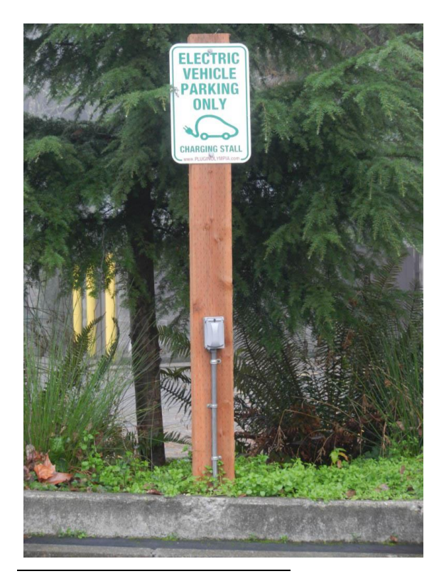
FIGURE 8: LEVEL 2 EV CHARGING STATION AT ANGLED PARKING IN RIGHT-OF-WAY

Information to help EV drivers locate charging stations remains insufficient. Drivers are reported to have difficulty locating public charging stations and, if they are not adequately signed, are unsure if they are available for public use.<sup>13</sup> Some communities have improved this situation. For instance, advocates of EVs have placed signage and mapped availability of Level 1 charging stations in Olympia, Washington (see Figure 9). However, some of these stations remain difficult to find due to the lack of way-finding signage.