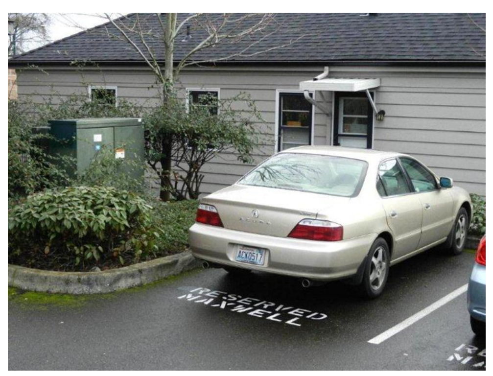
FIGURE 13: EXISTING TRANSFORMER NEAR POTENTIAL EV CHARGING STATION

EV supply equipment should connect on a dedicated circuit to an electrical panel. This usually involves installation of new conduit from the EV supply equipment to the panel. Costs tend to rise as the distance from the panel to the EV supply equipment increases. If available parking lies more than 50 feet from existing meters and panels, installers should evaluate additional choices. For example, utilities have the potential to bring new service either from existing transformers (Figure 13) found on the site or from a new transformer installed on, or near the property (such as in adjacent right-of-way).