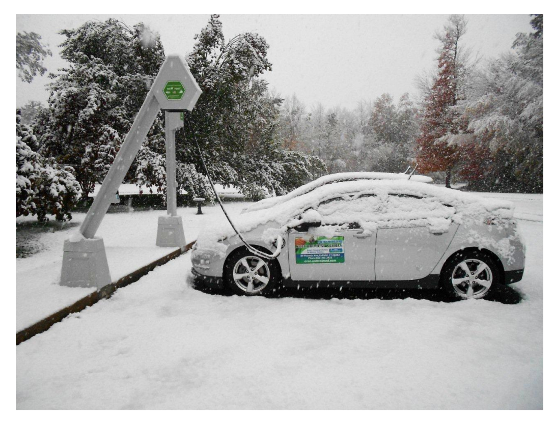
FIGURE 18: CABLE MANAGEMENT SYSTEM MITIGATES FOR COLD WEATHER CONDITIONS

Most brands of EV supply equipment manufactured for public and residential uses are suitable for outdoor use, although some perform better than others in extreme temperatures. Winter weather can impede the operation of EV supply equipment when covered in snow or ice. Cold weather charging is especially problematic while using the charging cable. Snow and ice can encase the cable if it is lying on the ground or otherwise exposed. This can be mitigated with equipment that has a retractable cable which remains flexible in extreme cold conditions (see Figure 18).