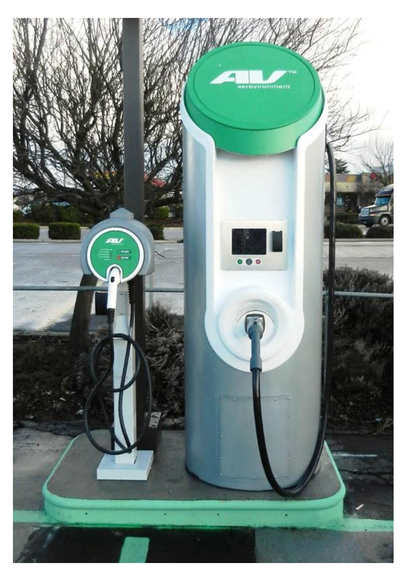
FIGURE 2: LEVEL 2 EV SUPPLY EQUIPMENT (LEFT) AND DC FAST CHARGER (RIGHT)

Both Level 1 and Level 2 EV supply equipment are sometimes misidentified as being EV chargers. The EV supply equipment's main purpose is to deliver power to a manufacturer-provided charging module, or charger. Chargers are supplied on board electric cars. Some lightweight EVs have external chargers attached to a power cable while others have an on-board charger similar to electric cars. The chargers convert AC to DC and deliver power to the battery according to manufacturer-specified rates (typically expressed as kilowatts). In contrast, DC fast chargers bypass the manufacturer-provided chargers to directly deliver power to the vehicle's battery.