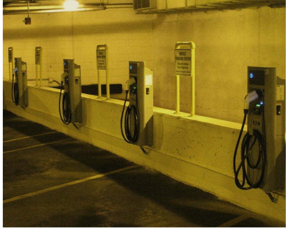
FIGURE 15: SURFACE-MOUNTED CONDUIT BELOW EV SUPPLY EQUIPMENT

Cutting, trenching, and drilling to add new conduit for an EV charging station can be very expensive. As an example, the installer might need to drill through a wall and trench into mature vegetation, walkways, and surface parking -- all of which would need repair after installing the conduit. Hardscape surfaces with special finishes and coloration can be expensive to repair or impossible to exactly match. Horizontal boring can reduce the need to cut and trench through special surfaces such as flagstone paving. Drilling through structural concrete can require x-rays to ensure that the structure's integrity is not compromised. The cost of installation can be avoided if existing conduit has adequate capacity to be utilized for new dedicated circuits. Installation costs also can be reduced by installing conduit onto existing surfaces as shown in Figure 15.