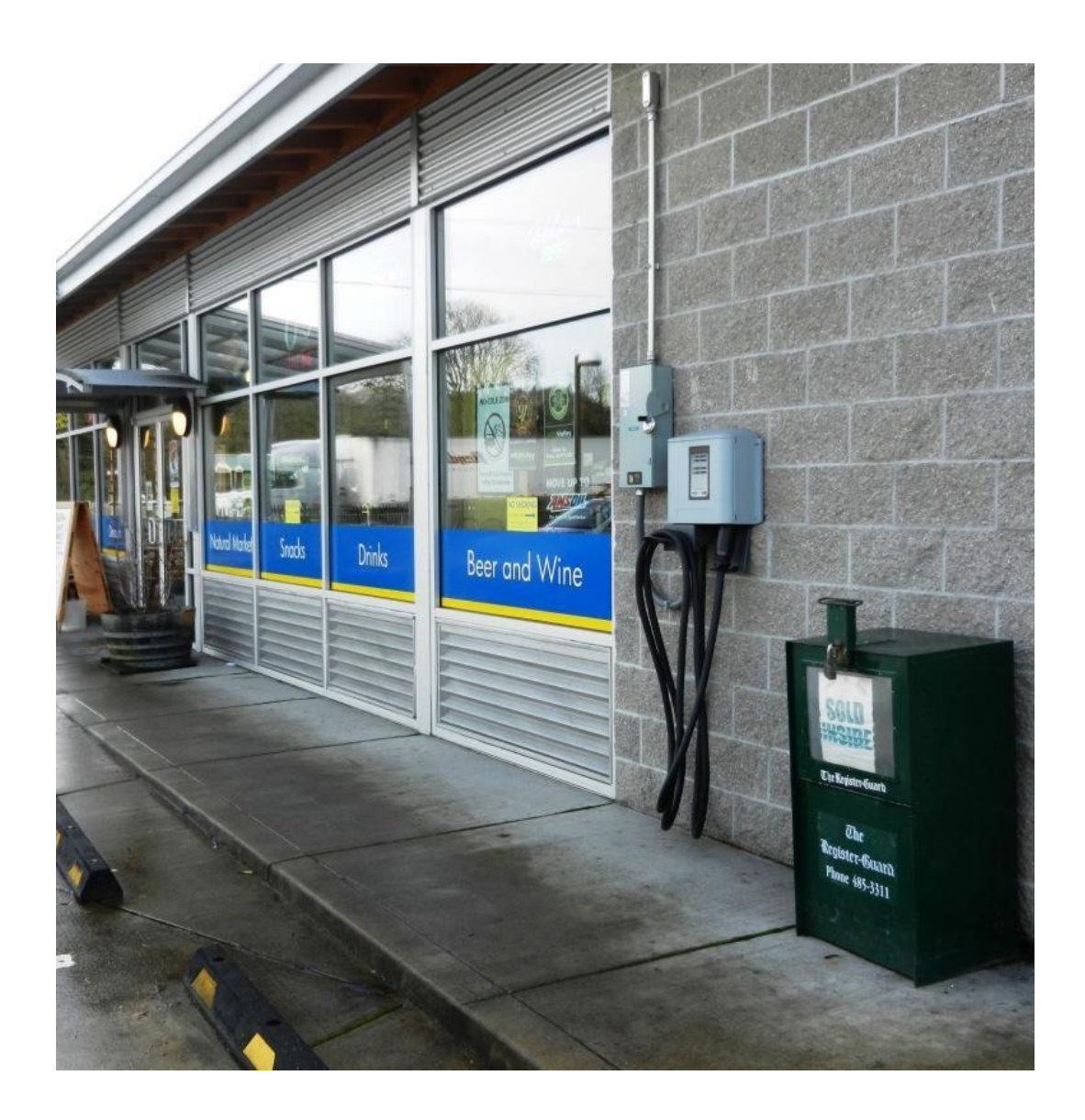
FIGURE 14: CHARGING CABLE USE WILL BLOCK SIDEWALK

While most EV charging stations can be placed away from high-demand parking spaces, at least one charging station should be conveniently located to accommodate persons with disabilities. ADA requires nondiscriminatory access to places that accommodate the general public. Commercial facilities that do not directly serve the public – like office facilities and warehouses – also must meet ADA requirements for new construction and alterations. This includes use of EV charging stations. Accessible charging will likely require increasing the size of the designated parking space. Parking spaces potentially can be restriped to gain extra space needed