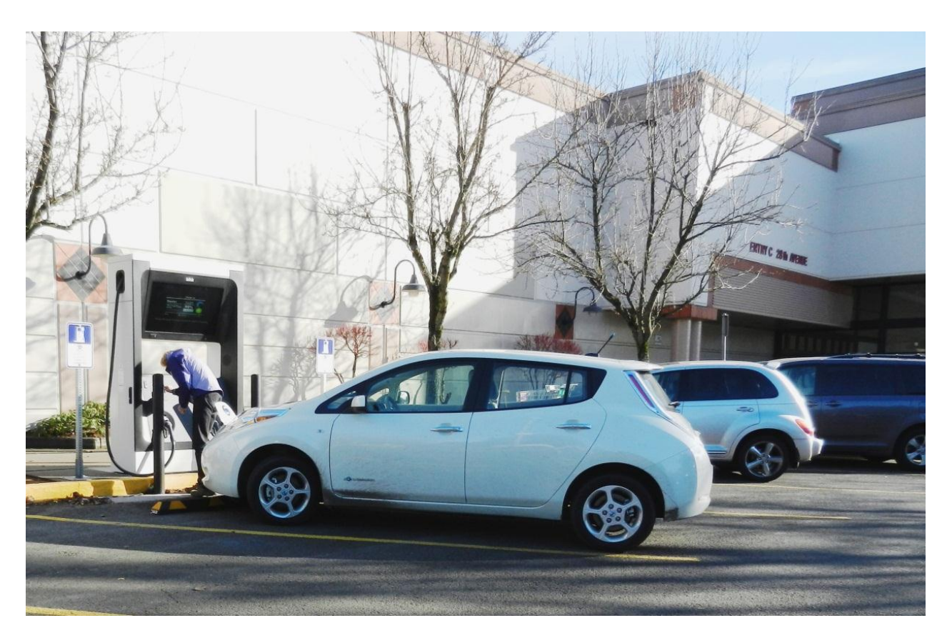
FIGURE 7: DC FAST CHARGER AT RETAIL STORE

Commercial charging network providers will seek to install EV supply equipment at highusage locations that are likely to prove profitable, such as the large retail store shown in Figure 7.