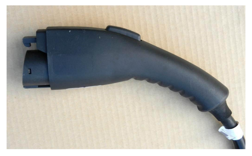
FIGURE 4: J1772 CONNECTOR

The Society of Automotive Engineers' J1772 connecter that attaches the Level 2 charging station to the vehicle is the U.S. national standard (see Figure 4). Almost all automobile manufacturers selling cars in the U.S. support it.