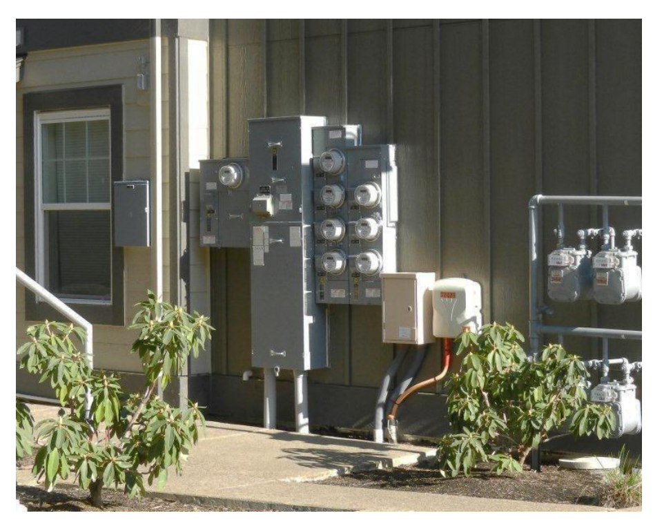
FIGURE 5: TYPICAL ARRAY OF METERS AT A MULTI-UNIT DWELLING

Multi-unit dwellings have main electrical panels and meters for customers clustered in centralized locations. Adding sub-meters and panels near already crowded equipment may be difficult (see Figure 5).