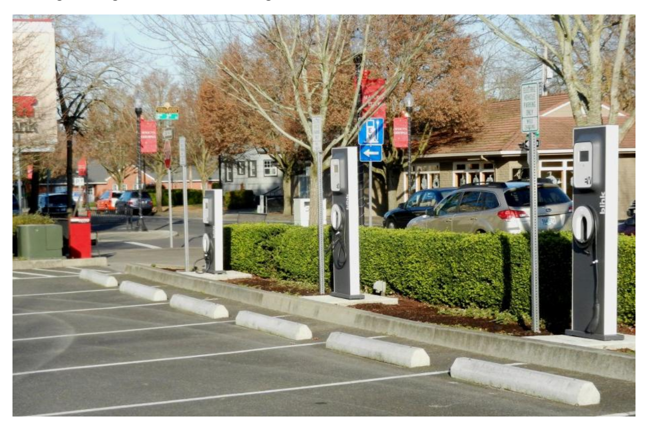
FIGURE 16: EV SUPPLY EQUIPMENT PLACED IN LANDSCAPING

Trenching in landscaping adjacent to parking sometimes can be less damaging than cutting through hard surfaces like asphalt concrete. Figure 16 shows EV supply equipment on new concrete pads set into existing landscaping directly adjacent to parking. The success of this approach depends on the plant material and location of existing underground utilities and irrigation.